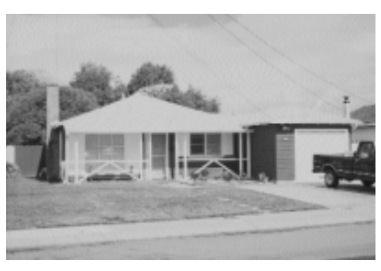
FIGURES 3a AND 3b Built in 1944-45, these two houses (upper left and right) have the same plan but different roof forms.

FIGURE 4 The corner window lends this 1947 house (lower left) a touch of modernity.