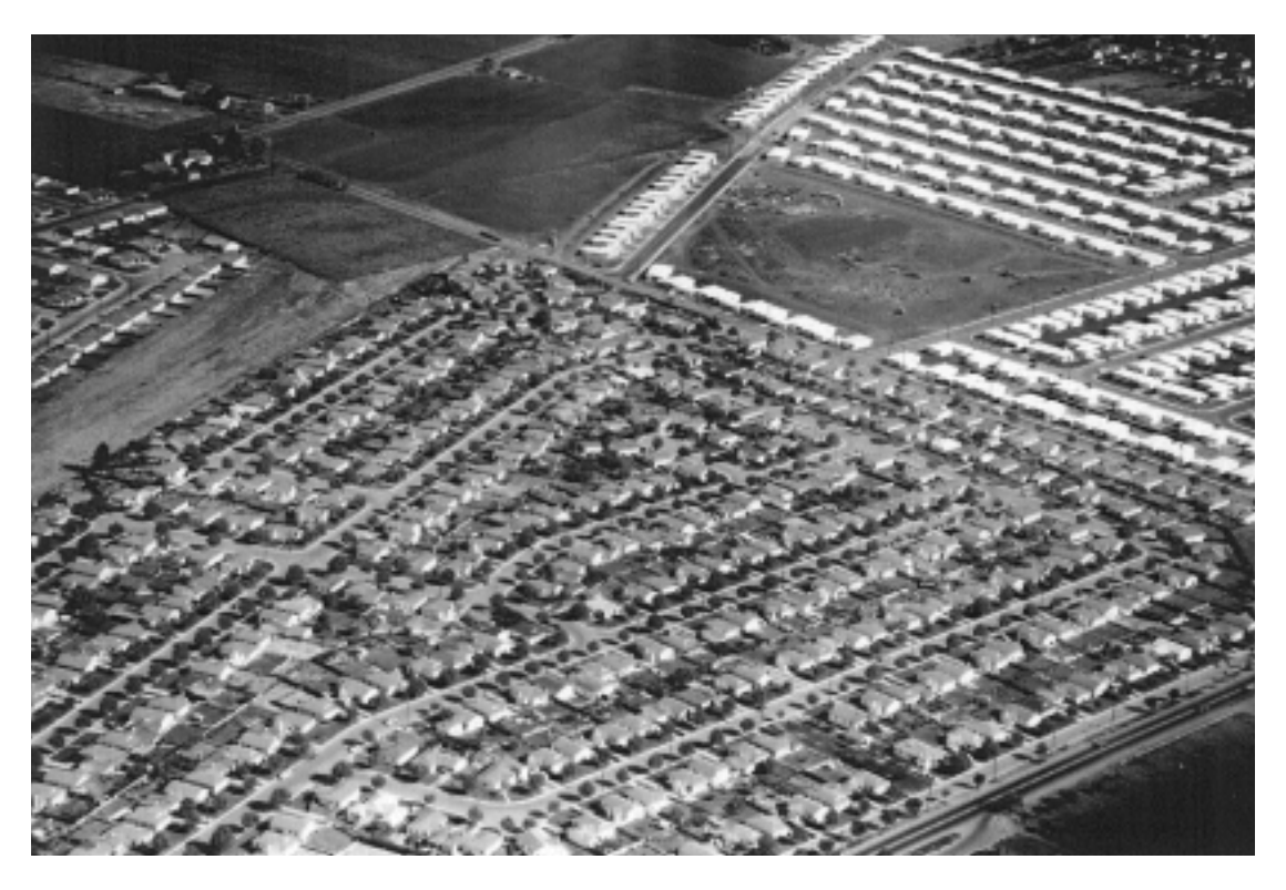
TIGURE 2 This aerial view of a portion of San Lorenzo Village was taken ca. 1950 as the street trees were beginning to mature. The buildings at the upper right are part of a later tract by another developer.

the postwar demand for affordable housing. Bohannon acquired 350 acres of farmland in the unincorporated area between San Leandro and Hayward and built nearly 1,500 houses in 1944 and 1945. (Figure 2)