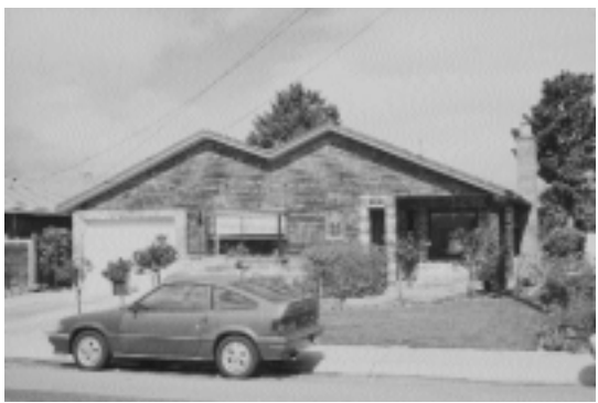
This moderately altered house has replacement windows, stone veneer on the facade, and a garage converted to additional living space.