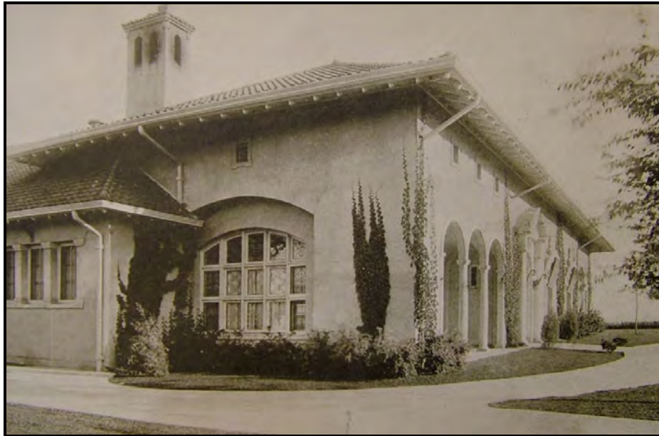
Figure 10. This view (south-southeast) of the Cranmer House shows part of the north wall including the large arched dining room window and an oblique view of the front.

Highway planning; development of a city stone quarry on Table Mountain near Golden; construction of a flood control dam on Cherry Creek; and the acquisition of Weir Gulch. 19