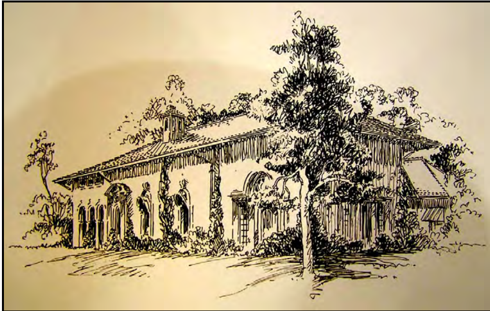
Figure 1. This architectural rendering showing the front and south wing of the Cranmer House by Benedict was published in 1925 in a compilation of the architect's work. SOURCE: Benedict, The Work of J.B. Benedict .

"...an Italian Renaissance confection of arches and finely carved decorations set on a swath of lawn adjoining Cranmer Park." 1