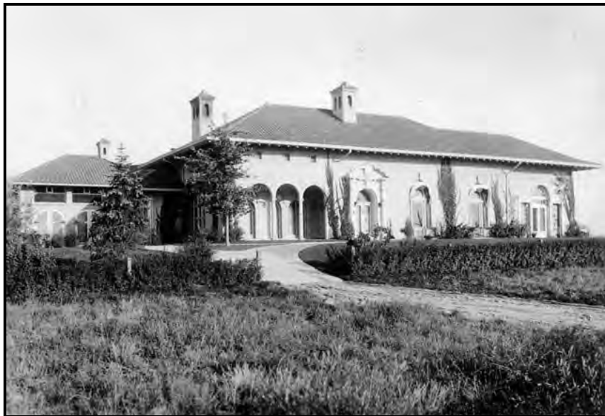
Figure 8. The front and the garage wing (left) of the Cranmer House are shown in this view (east-southeast) from about the mid-1920s.