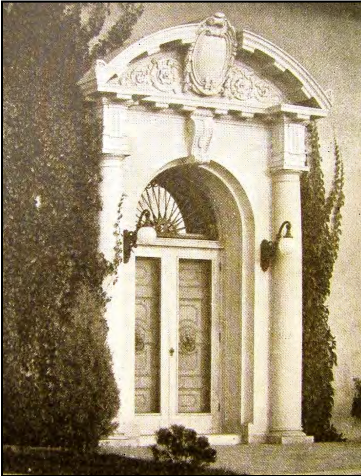
Figure 2. The front entrance to the Cranmer House was featured in a 1925 publication of Benedict's works.

Cranmer House, Denver County, CO The Architecture of Jules Jacques Benois Benedict in Colorado MPS