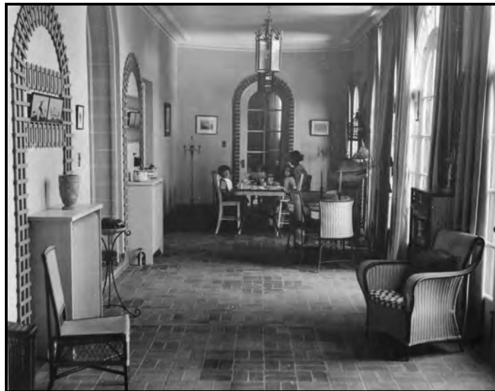
Figure 5. The rear hall of the Cranmer House (view north) with the Cranmer children at the table is shown in this circa 1920 image.

Dining Room. The large, rectangular dining room at the northwest corner of the house has a flattened barrel vault ceiling divided into panels by wood ribs (Photograph 15). At the center of the ceiling is a hanging metal chandelier. There is cornice molding and a paneled frieze on the west, east, and south walls of the room. The walls are finished in smooth plaster, and there is a low wood wainscot and wood floor. The large segmental arch window on the north wall, featuring fifteen walnut-framed panels, and the large arched openings facing the loggia provide natural illumination.