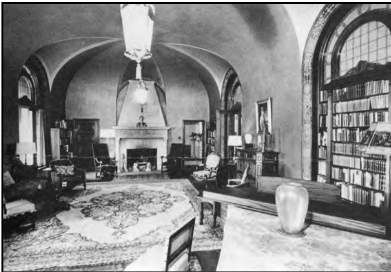
Figure 3. The living room at the Cranmer House is shown in this view to the north in the 1940s.

There is a tall, rectangular, stucco chimney with arched insets at the north end of the east roof slope of the main wing. 5 The rear wall of the main wing of the house has a band of six-light windows near the top of the wall divided into groups of three by stucco pilasters (Photograph 8). At each end of the band of windows is a deeply inset oval window. The first story has three large semicircular arched multi-light doors with continuous multi-light surrounds. The doors face the rear courtyard. English ivy covers the east wall, growing around the windows and doors.