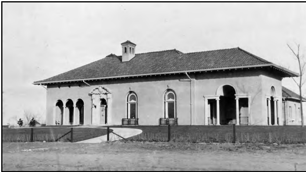
Figure 7. In this early 1920s view (east-northeast) of the Cranmer House the sunroom is not enclosed.