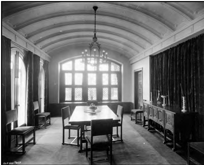
Figure 4. The Cranmer House dining room is shown in this circa 1930s view to the north.

A two-story hipped roof garage/guest quarters extends from the northeast end of the loggia (Photograph 9) and has a short chimney with pyramidal tile roof and arched openings. The south wall has inset openings near the top of the wall with paired two-light windows. The first story has two inset four-light windows. Extending from the east wall of the north loggia is a stucco wall trimmed with sandstone. The wall originally extended further towards the back of the lot and had an arched entrance gate.