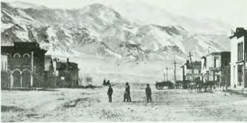
Wide avenues were a feature of Palmer's Colorado Springs.

untroubled by nearby competition, he purchased about ninety-three hundred acres. The unexpected size of this purchase forced Palmer to wire eastern friends to obtain sufficient funds. 17