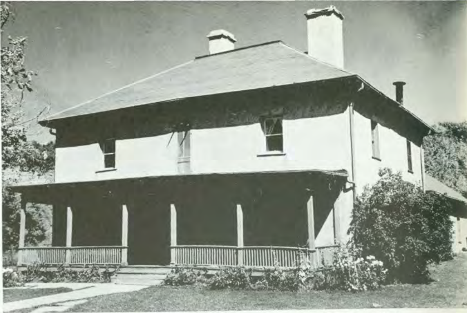
Uncle Dick Wootton's house still overlooks the old toll road. A chain across the road forced travelers to pay or turn back.

Valley. The west was rimmed by the rugged profile of Spanish Peaks, the Greenhorns, Pike's Peak. In this cow-promising plateau he would "have the world to himself," but not before he verbally grappled with Uncle Dick Wootton. Wootton, a giant mountain man (6 feet, 4 inches, 260 pounds) with the grim visage of Daniel Webster, had set up a toll station on the Colorado side of the pass. The charge was ten cents an animal. Goodnight, tall but only 200 pounds—muttered he would find another pass—Wootton laughed there was no other. 18