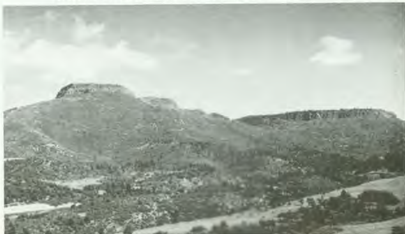
Raton Pass, where Oliver Loving drove his Longhorns in 1866.

to Denver, where he sold to Colorado's most prominent ranchman, John Wesley Iliff. Goodnight took the $12,000 in gold from the steer sale and twelve days after reaching Texas had put together another herd of twelve hundred steers. Within forty days, he had them at Bosque Grande, forty miles below Fort Sumner. Loving joined him, and as they went into winter camp, they became the first Texans to locate a southern New Mexico ranch. 13