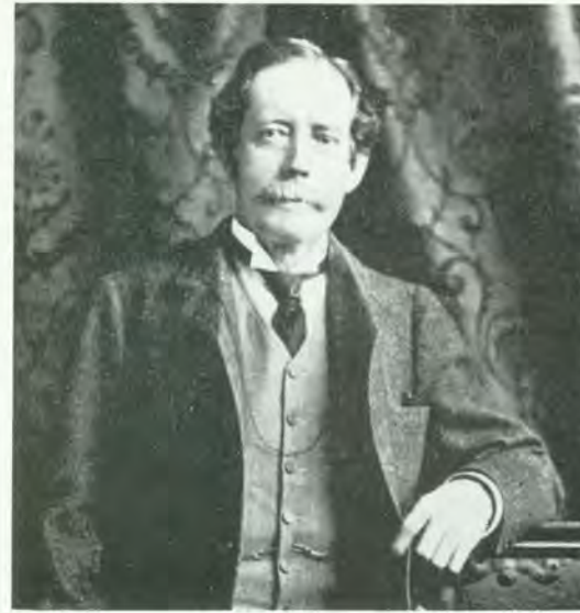
William Jackson Palmer

Palmer's promotional ventures drastically affected the five towns of Colorado City, Pueblo, Canon City, Trinidad, and Animas City. During the period from 1871 to 1881 Palmer's railroad never voluntarily entered any major town in Colorado except Denver, the northern terminus of the Denver and Rio Grande. Palmer had little trouble replacing Colorado City and Animas City with his own Colorado Springs and Durango, both of which became county seats soon after their foundation. South Pueblo, Labran, and El Moro competed less successfully with the county seats of Pueblo, Canon City, and Trinidad. These three towns might have succeeded had Palmer been able to muster the necessary financial backing to establish them soundly. His failure was in large part due to conditions arising from the Panic of 1873.