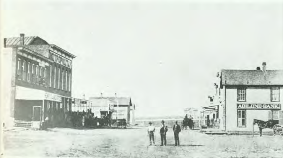
Broadway Street in downtown Abilene, 1875.

Thus by the early months of 1867, during the time Joseph G. McCoy was making final preparations for the first wave of southern livestock at Abilene, the federal military establish-