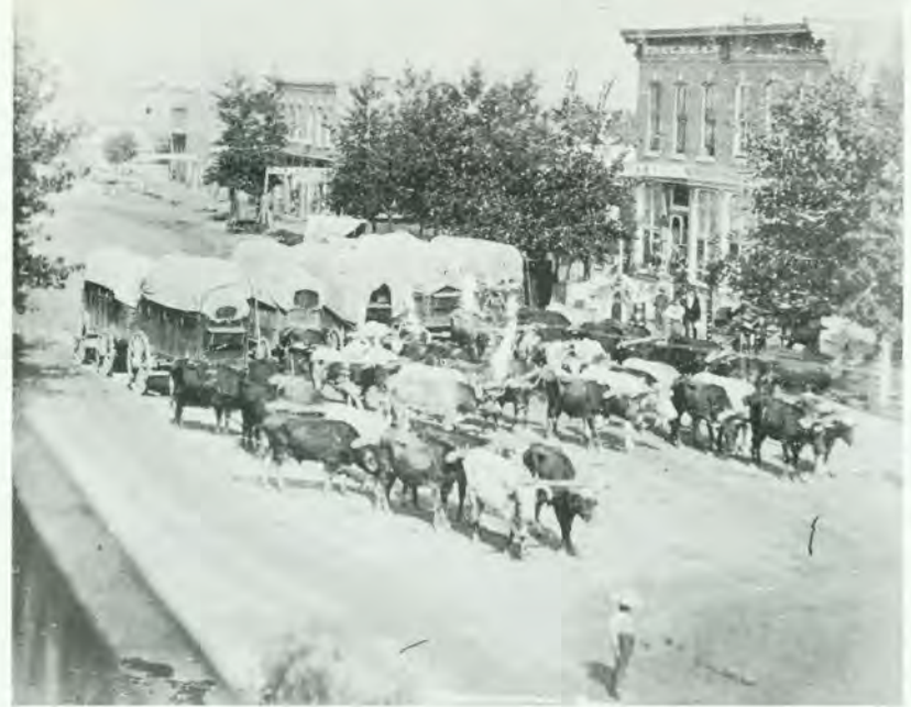
Ox-drawn freight wagons in Canon City in the early seventies.

and conceived, no doubt, in an honest spirit, and it was hailed with joy by the then isolated Coloradoans; and with their proverbial liberality they lavished everything upon the pioneer 'baby' road. But soon after the first train of cars had been launched upon its track, it had become apparent to the shrewd observer that the 'pioneer' road was to be used as a means of gouging every one but the officers connected with it. It has never been a legitimate railroad company, expecting to derive its dividends from performing the duties of a common carrier. That was too much like 'working for wages.' There must be some 'wheel within a wheel,' that the managers could make something 'on the side.' Accordingly, the N. L. Co., afterwards the C. C. I. C. and the U. C. Co. was organized. 23