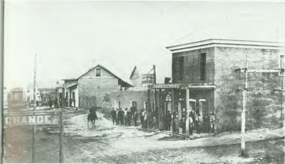
Trinidad about 1869 was still an adobe town.

Palmer and his associates next prepared to extend the Denver and Rio Grande to the south, and in order to do this they accumulated properties which were consolidated into the Southern Colorado Coal and Town Company, incorporated in 1876. In April of that year the Denver and Rio Grande reached the vicinity of Trinidad, where the town of El Moro was platted by the new land company. Palmer clearly expected trouble, for as early as 1874 he had written of "our new proposed town site of Trinidad . . . there will probably be the same sort of fight that we had with Colorado City." 27 El Moro was located about five miles from Trinidad, and for a time it prospered. In 1876 the Southern Colorado Coal and Town Company built six experimental coke ovens there, and these having been