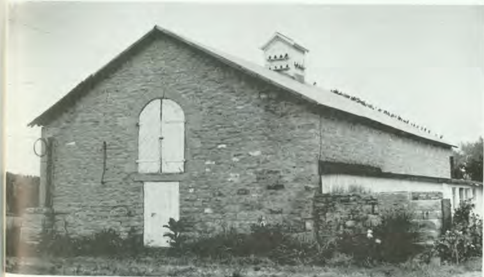
The stone barn at Goodnight's Rock Canon Ranch.