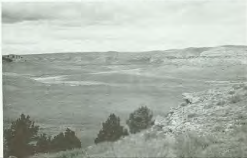
John Wesley Iliff's Chalk Bluffs ranch near the Wyoming line.

At Iliff's death in 1878 he dominated a triangular-shaped range of 150 miles from Julesburg to Greeley, yet he had purchased only 15,558 acres. In this total were 105 land parcels in 54 locations, monopolizing water along the South Platte and its tributary lakes and streams. Goodnight followed much the same plan around Pueblo, and later and to a greater extent in the Texas Panhandle. 25 Although he ultimately bought considerable land as the free range passed, his initial water acquisitions made easier the purchase of surrounding country, as it would have for Iliff had he lived.