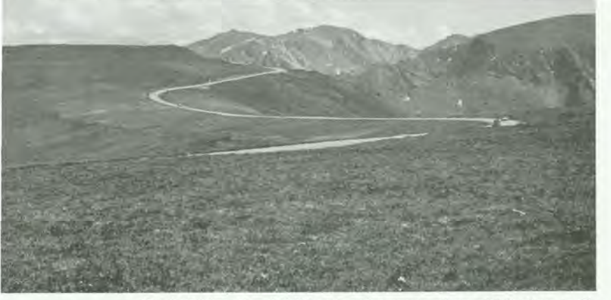
Trail Ridge Road, following the route of an old Indian trail, crosses the alpine tundra land in sweeping curves.

is recovering, and the health of the deer and elk is greatly improved. Although their numbers are not so great as they were in past years, they are still readily observed and are still a major attraction, particularly to park visitors in the fall and winter seasons.