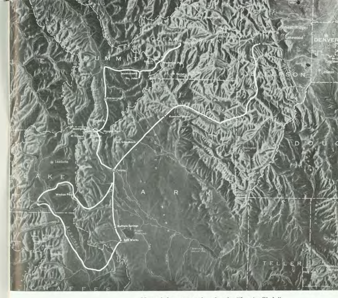
Map of the route taken by the "Lupin Club."

Our camping tour has begun. We left Creswell³ this morning at 10 A.M. for Twin Lakes, a pretty place high up in the mountains, one hundred and twenty-five miles southwest of Wilson's Ranch. We have traveled eighteen miles today meeting with no accident and no adventure whatever, except the rather tame one of capturing a grouse which has been served for supper and found very palatable. The road we came over was very beautiful though Uncle George says it is nothing compared to