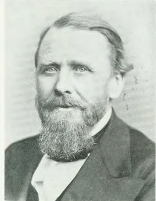
GOVERNOR JOHN EVANS