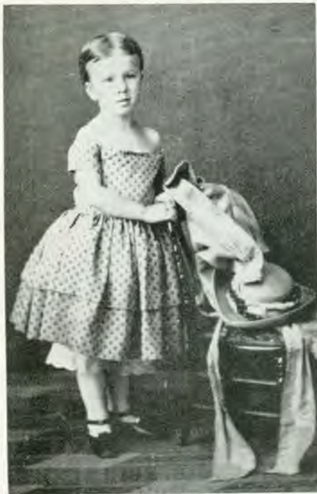
C. Phelps Dodge, Evergreen