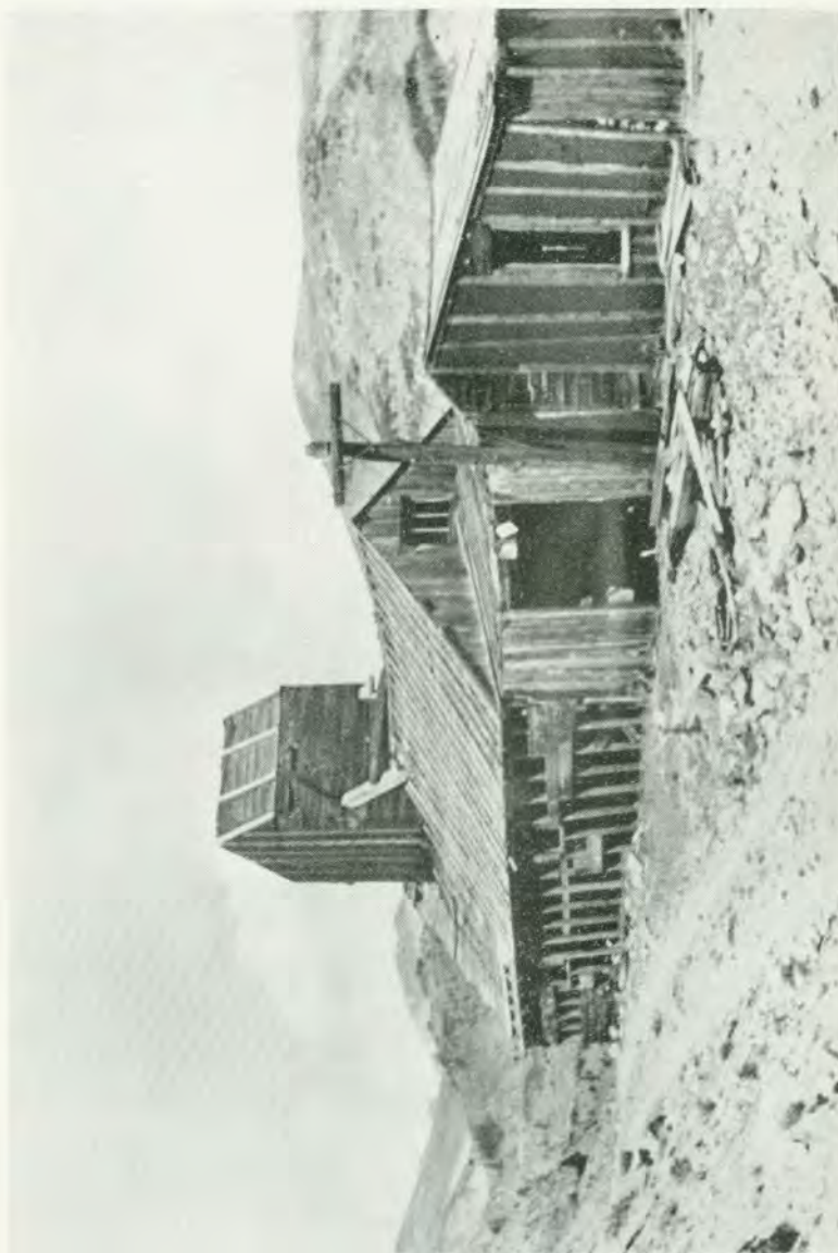
An Old Shaft House on Caribou Hill