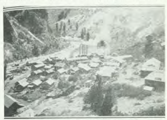
EAST PORTAL, Review of Reviews

men while rescuers labored in three - minute shifts on a temporary opening. Constantly the entombed men implored their rescuers to hurrv. Those first reached took their turns at the shovels to extricate their companions. Six men perished in their particu-