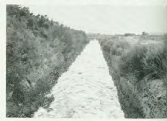
IRRIGATION DITCH. UNCOMPANGRE VALLEY

had to be completed, finishing touches had to be put on the tunnel itself, and so on. Indeed, the overall project wasn't considered complete until mid-1923, at which time expenditures had reached $6 .-715.074.41, almost half of which had gone for the tunnel.97