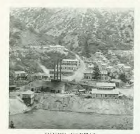
RIVER PORTAL World's Work

449 feet of heading advance was driven in one month. The enlargement of the undercut drift to full tunnel section was accomplished by two gangs at an average rate of 1,665 feet per month. During the course of excavation, more than five million two-horse wagon-loads of debris were removed. The course of description of the course of debris were removed.