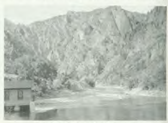
EAST PORTAL, BLACK CANYON

inspectors. Good stores, boarding houses, a post office, school, two churches, and a hospital were started. By August 1, 1905, about 350 men were employed at the West Portal, and the town of Lujane grew to about 800 inhabitants 80