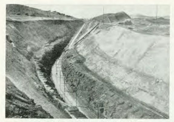
TUNNEL, UNCOMPARGRE END

of Montrose. At the completion of the feast, the people of Lake City presented the President with a 7½-pound trout to dine on the next day. The day ended as the President was escorted back to his private car by the western sheriffs to the accom-