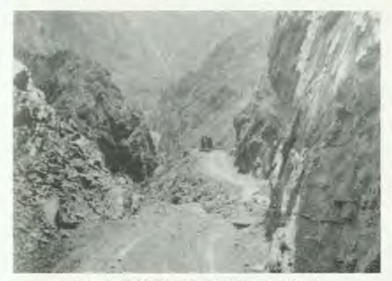
ROAD DOWN TO RIVER PORTAL

itself decided to carry out the construction, which started in July. It was essentially completed by October 1, 1904, except for a few additional turnouts and widening at a number of places, by force account. The grade where the road switchbacked down into the gorge was as much as 23%, the steepness permissible because no loads would have to come up out of the canyon.47 The job involved the excavation of 30,000 cubic vards of material, the clearing of 38 acres of roadway, the construction of nineteen wooden box culverts and 300 linear feet of cribwork along cliffs.48