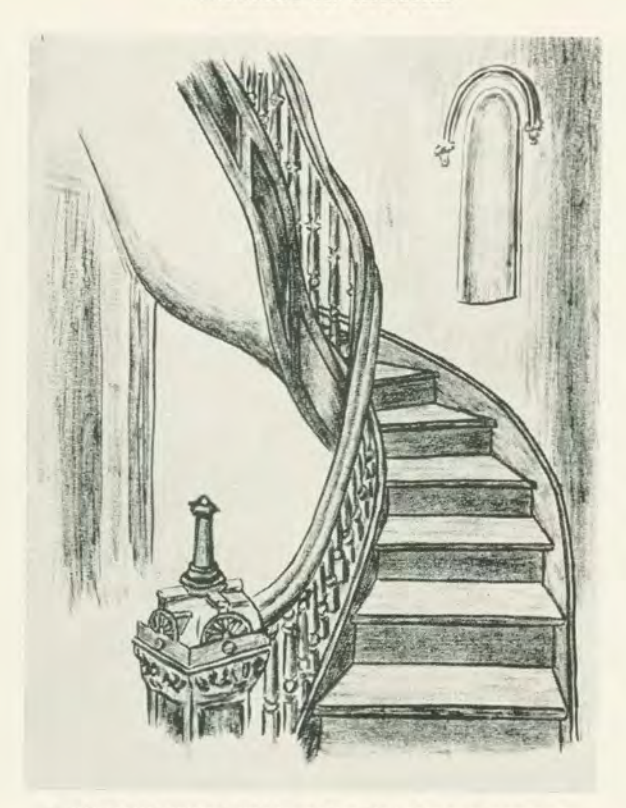
UNCOMPLETED STAIRCASE, HAMILL'S OFFICE

Still adding to the beauty of the house and its grounds, Hamill constructed a fountain in the yard in 1881 and planted ornamental trees.<sup>10</sup> In 1879 he began the construction of the office building at the rear of the yard to take care of his wide business interests in mines and his duties as a leading member of the Republican party in the state of Colorado.<sup>11</sup> Before the upper floors of the building were completed, the silver crash had come and with it, the destruction of the source of any value from the silver from which Georgetown drew its wealth and power. The beautiful suspended staircase which connects the three floors of the office building was never completed and stands as mute evidence of the impact of the silver crash upon the lives of the people of Georgetown. One can see the preparations which had been made on the railing of the staircase for trimming which was never put in place. The massive desk in the main room of the office building displays once again the lavish use of walnut and maple wood along with gold and silver trimming which one also finds throughout the house. As an example of the eye for detail which the Hamills had, even the doorknobs in the house were at one time plated with gold and the catches on the windows were plated with silver. The master bedroom, the only room in the house which does not have the original wallpaper. contains a marble fireplace of Carrara marble imported from