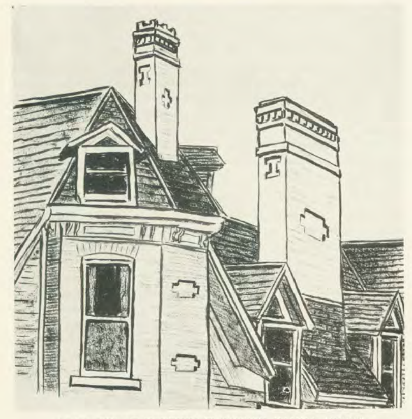
CHIMNEYS AT NORTHEAST CORNER HAMILL HOUSE

The regard and esteem in which he was held by the party is apparent by the honors which it wished to confer upon him. In 1880 he was suggested as a candidate for the governorship of Colorado.29 When delegates were being considered for the Republican Convention in Chicago in 1881 his name was among those brought up for consideration along with those of Governor Pitkin and Willard Teller.<sup>30</sup> Hamill refusing to pull strings for himself as some of the other aspirants did, was not nominated. In 1883 when one of the United States Senate seats came up for appointment