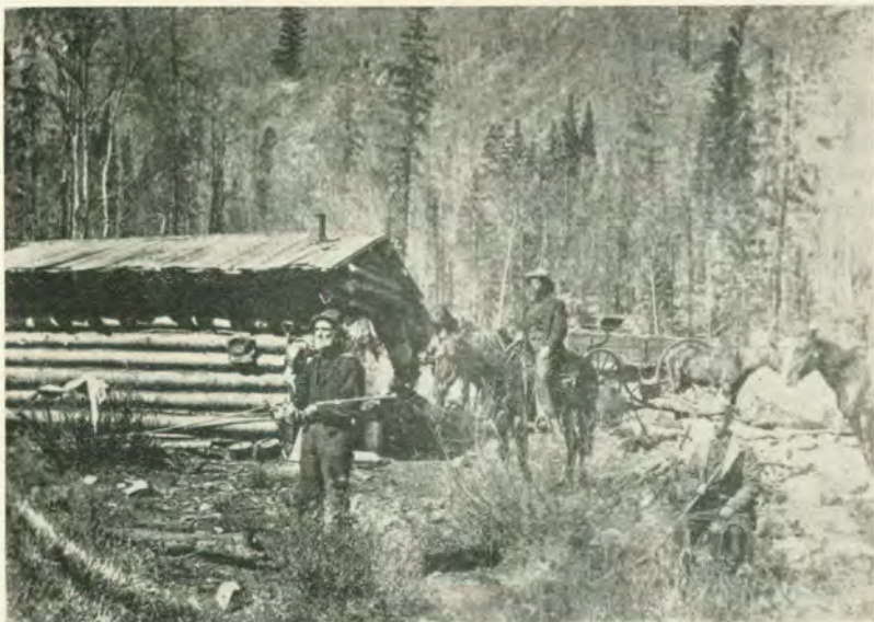
McCray-Gammon-Stark Cattle Camp, St. Elmo, 1880