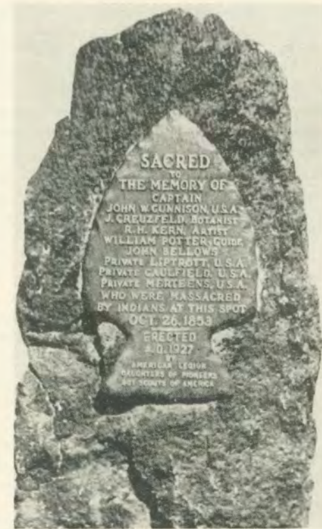
MONUMENT AT SITE OF GUNNISON MASSACRE

the first fire. Captain Gunnison rushed from his tent unarmed, in a gesture of friendship, talking to the Indians and telling them to hold their fire for he was their friend. 50 The reply was a volley of arrows which pierced his body. He slumped to the ground. Four of the men succeeded in making their escape, but they were pursued for a long distance before eluding the Indians.