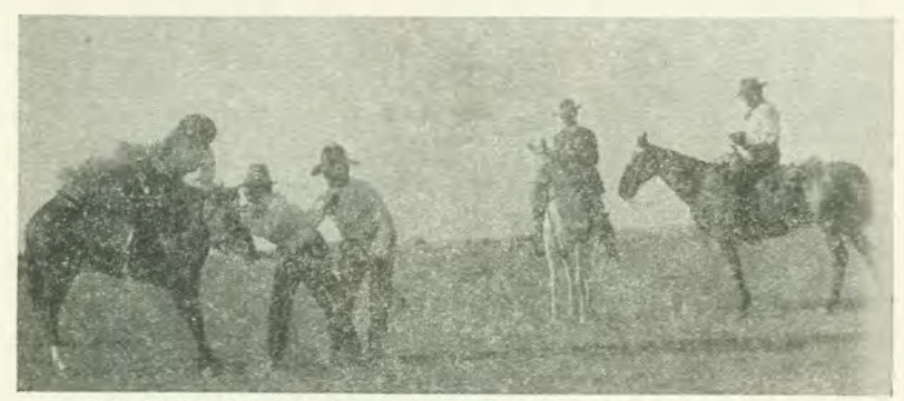
COWBOY TAKING HIS SEAT FOR A RIDE ON A BUCKER

For this magnificent piece of horsemanship, the cowboy from the Mill Iron ranch won the title "Champion Bronco Buster of the Plains," and also the prize, a suit of clothes.