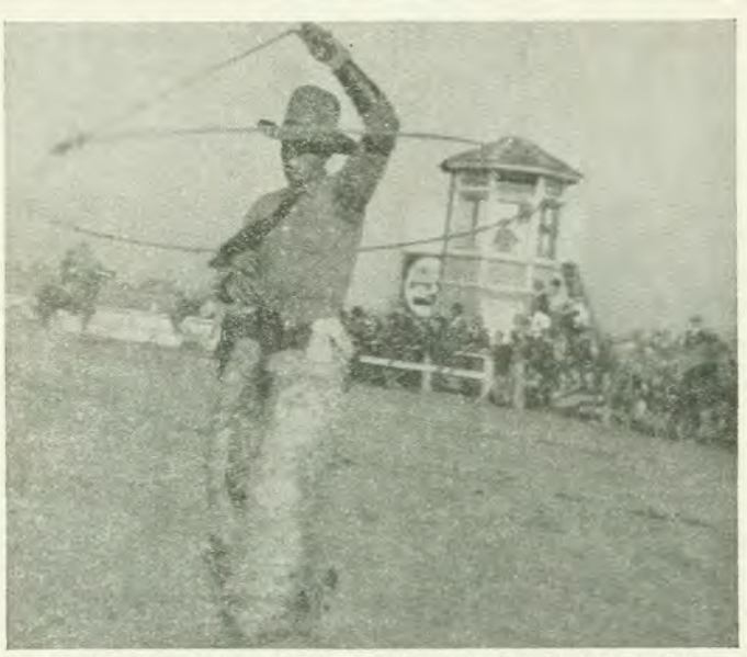
FANCY ROPE TWIRLING, A FAVORITE COWBOY SPORT

Prize $200—Showing the method of roping a steer for the purpose of branding, inspection, etc. By two men operating from horseback; one to rope the head the other the hoof of the steer. The steer not to be thrown.<sup>35</sup>