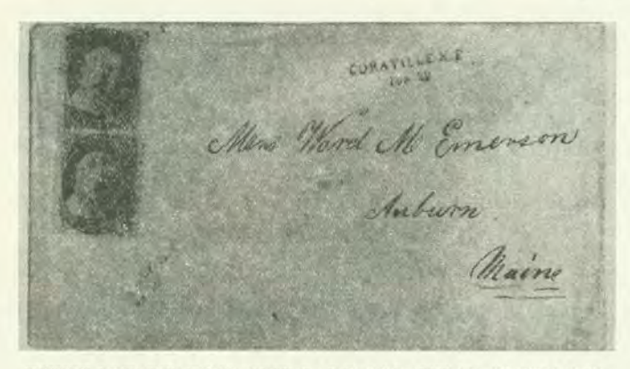
ENVELOPE BEARING THE RARE CORAVILLE POSTMARK, JUNE 22 [1859]

Thus far we have seen no evidence that the Coraville Post Office ever acted in its normal capacity of a post office by permitting dispatch of letters at the established postal rate of 3c. Illustrated, however, is a cover which was postmarked Coraville, K. T., June 22, 1859<sup>3</sup>, and apparently mailed and carried at the regular 3c rate. (One of the stamps has been removed and lost, although a portion of its postmark cancellation remains.) How did such an envelope come into being if the