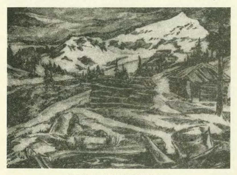
IRWIN AS IT APPEARED IN 1946

By 1883 the town was so well established that it had several streets lined with frame buildings and marked with iron street signs, a schoolhouse and a waterworks. The water from Lake Brennard (now Lake Irwin) was piped several hundred feet through the hill at the upper end of Main Street and then through town, to supply a series of water hydrants which had been installed. Yet by the end of that very year no ore was being shipped and but few miners were employed in the mines. "One by one