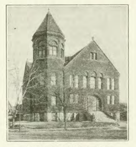
UNITY UNITARIAN CHURCH, BROADWAY AND EAST 19TH AVENUE, DENVER

constantly increased, so that the little church at 17th and California Streets was crowded to the doors, and it became manifest that a larger edifice was required, with the result that early in 1886 the original church was sold, and 3\frac{1}{2} lots located at the northeast corner of Broadway and East 19th Avenue were purchased and the present building erected thereon, the cornerstone being laid November 7, under the auspices of the Grand Canton