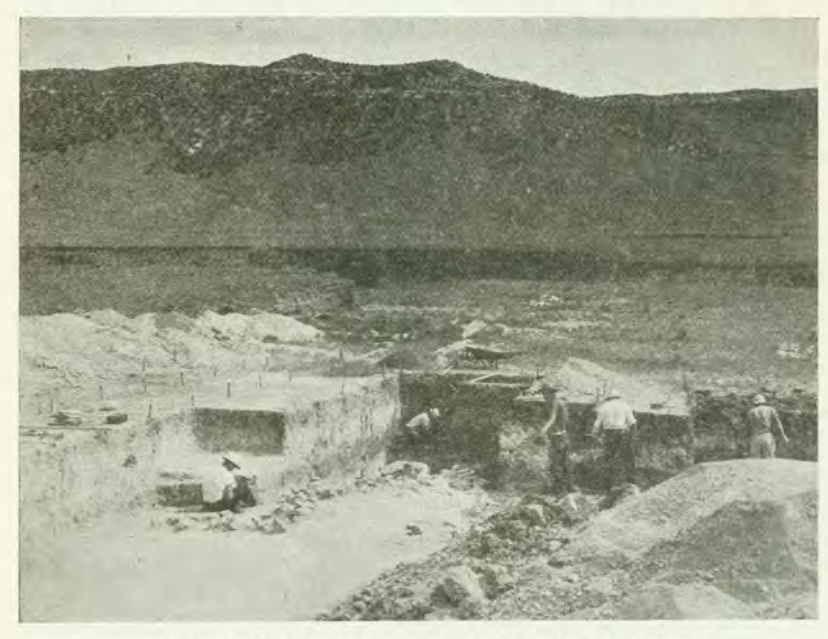
EXCAVATION WORK AT THE LINDENMEIER SITE

each succeeding new surface were also buried. After the valley was abandoned by its human occupants conditions conducive to the growth of vegetation remained favorable for a time and the soil zone continued to develop. Then an era of erosion set in. Sand, gravel, and boulders were swept down from the hillsides and the grassy slopes and bottom were covered to a depth of several feet. It was during this period that the bordering ridge on the southern side disappeared, some of it contributing to the valley fill and the remainder being carried away toward the south. Water subsequently cut a broad channel in the valley bottom, removing all of the deposits along its course down to the top of the old tuff-clay but not disturbing the layers on the southern slope. The later channel, in turn, was filled with gravelly alluvium washed in from the ridges on the north and the upper part of the valley at the west. This material also covered the lower borders of the old, undisturbed