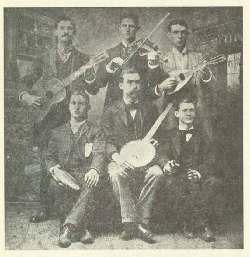
TROUPE OF THE LINIMENT SHOW (The Doctor is seated in the center; the author is seated at his left)

While in Chicago I had organized a new quartette—knowing that a singing four, who could do single specialties, could furnish the entire show and demand top money—and this was the group that joined the "liniment show" at Alton, Illinois. The "sole