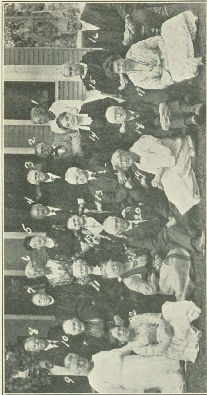
PIONEERS OF THE UNION COLONY OF GREELEY (Taken in 1923)