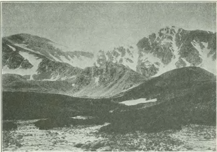
GRAY'S PEAK AND TORREY'S PEAK

'We, your friends, would say to you who now stand here upon the very central pinnacle of our widely extended country, as the inscription on the monument of Sir Christopher Wren, at St. Paul's says: Si monumentum requiris, circumspice . We bid you welcome to this magnificent peak. May you and your excellent wife, when you leave these wild and rugged scenes for your classic home in Cambridge, remember the pleasant social gathering we had on Gray's peak.